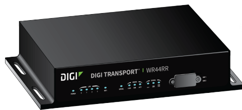
TransPort WR44 RR

Note A loose label sticker that includes the unique device password is included in the box. Retain this label sticker with your hardware records. This default password will be needed if the device is factory reset and you want to access the web UI on the device or register the device with Digi Remote Manager. If the device was already registered with Remote Manager at the time of the factory reset, you do not need the unique password to access the device in Remote Manager.