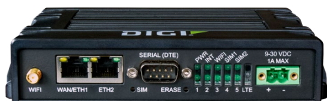
Digi IX20 — front