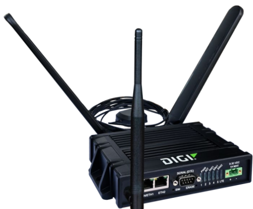
Digi IX20 — with cellular, GPS and Wi-Fi antennas