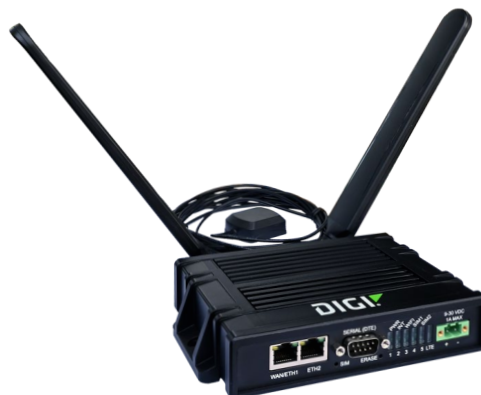
Digi IX20 — with GPS and cellular antennas