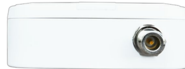
Digi HX20 Gateway for LoRaWAN — top