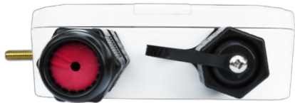
Digi HX20 Gateway for LoRaWAN — bottom