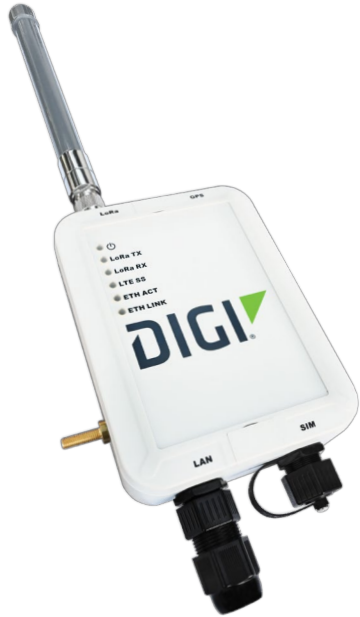
Digi HX20 Gateway for LoRaWAN