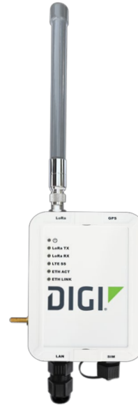
Digi HX20 Gateway for LoRaWAN — front