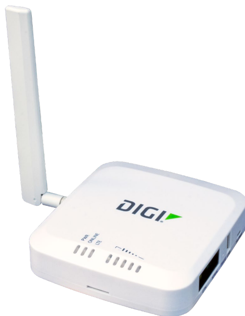
Digi Connect IT Mini— left